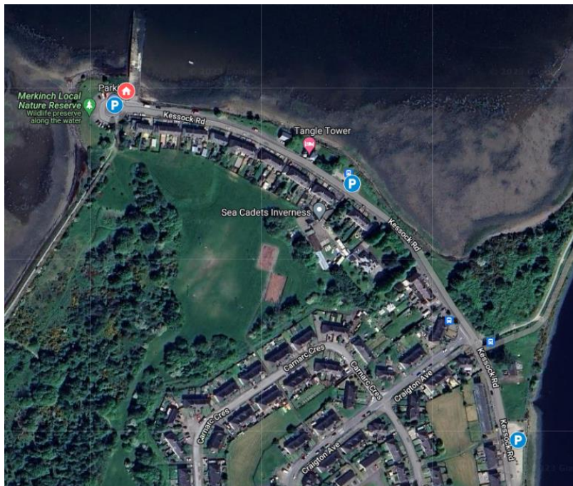
Car park overview

Parking: There will be 3 car parks available (marked P on map below), all being along Kessock Road. Furthest car park is 500m from event centre. Plenty space for bike parking and the No.3 bus takes you right to the event centre.